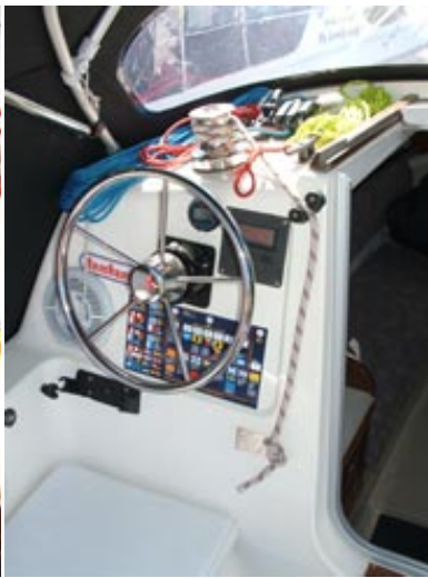
15 Hp Mercury