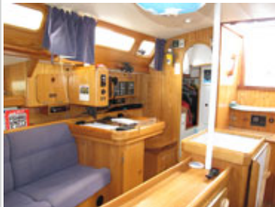
Interior looking aft