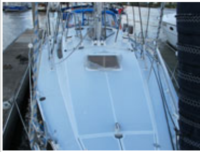
Cockpit looking forward