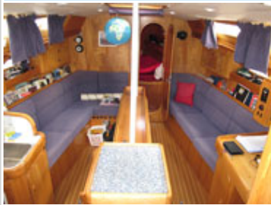
Interior looking aft