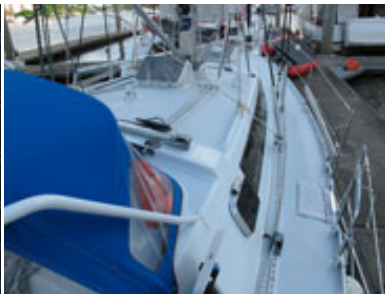
Cockpit looking aft